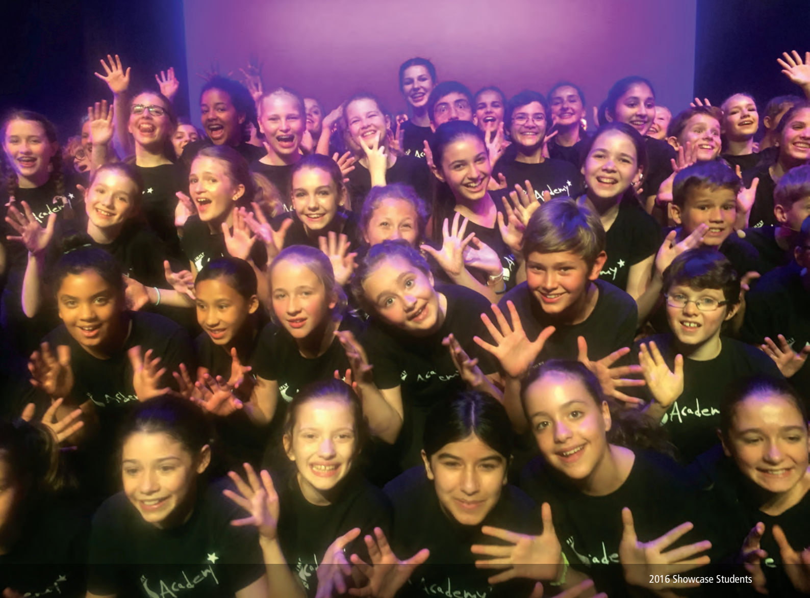
2016 Showcase Students