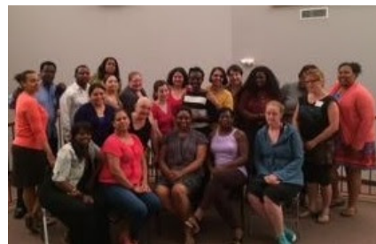
Graduates of the SJMI training