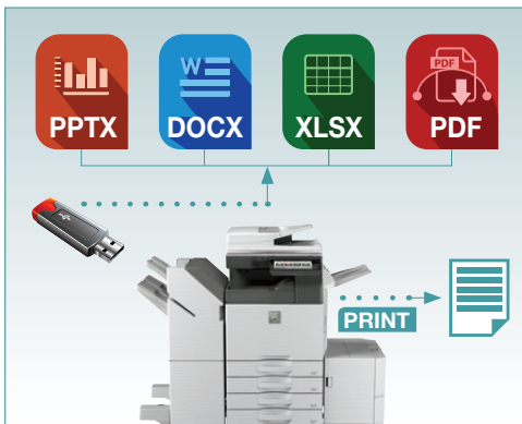
Direct print to popular file formats seamlessly with Sharp's available direct print expansion kit. 1