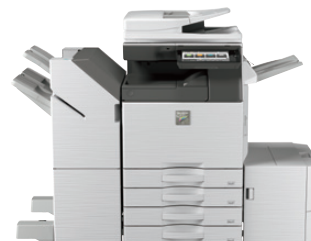
MX-4050N shown with 3K saddle stitch finisher and large capacity cassette.