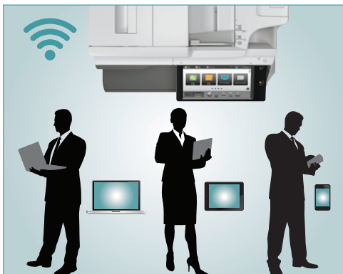
Available wireless network interface for convenient scanning and printing from mobile devices.

From paper handling to networking, the MX-3050N, MX-3550N, and MX-4050N color Essentials Series will exceed your expectations.