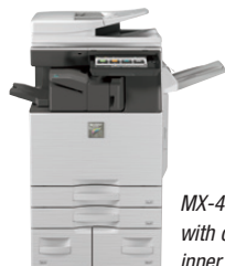
MX-4050N shown with compact inner finisher.

When it’s time to get the job done, the Essentials Series color document systems are outstanding performers. Quickly scan documents at speeds up to 80 images per minute . Then use the manual stapling feature on select finishers to restaple your originals. Multiple finishing options give you the output you require, be it stacked, stapled, or saddle-stitched. There’s even an available built-in stapleless staple feature, which can bind up to five sheets of paper by adding a crimp to the corner of the set, saving regular staples for larger sets.