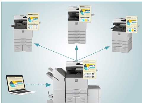
With serverless Print Release technology you can securely print a job and release it from any of five color Essentials Series models.