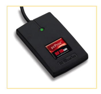
MX-SW100 works with Sharp OSA Partner Program Member card reader solution for convenient print release with ID card.