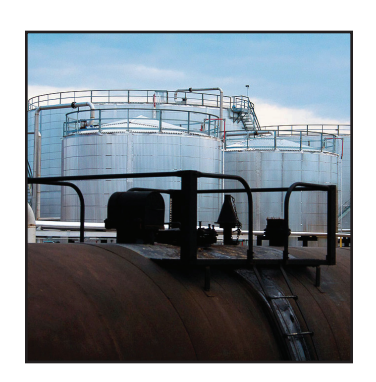
Asphalt Terminal Siting, Planning, and Permitting

BBJ Group assessed potential emissions for a global electronics manufacturer that was constructing a new facility to replace an existing facility. The company initially anticipated needing a minor source permit, but BBI Group's recommendations regarding process changes allowed the new facility to remain within the state's permit-by-rule framework. This allowed the facility to come on-line earlier than anticipated.