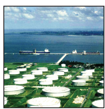
Bulk Petroleum Terminal Retrofit