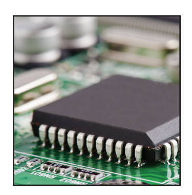
New Electronics Manufacturing Plant