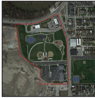
Lyons Community Center

BBJ provided site redevelopment services to the Village seeking to improve a 17-acre former quarry that had been filled. BBJ assessed contaminants, directed remedial measures, led public hearings, and pursued brownfield grants. The area was redeveloped with a community center, police station, park and commercial businesses. The vapor mitigation system installed allowed the complex to receive one of the first NFRs for indoor inhalation.