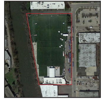
CIBC Chicago Fire Pitch

As part of a 56-site U.S. and international portfolio, BBJ oversaw the cleanup of a 1,600,000-square foot television and electronic parts manufacturing complex in Melrose Park, IL. Site investigation incorporated plume stability modeling of contamination. A comprehensive NFR was issued for the site. Other services performed included insurance cost recovery, decommissioning and strip-out for redevelopment of an intermodal logistics warehouse.