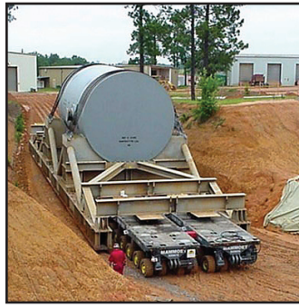
Low-level Radioactive Waste Facility

BBJ Group provided the South Carolina Budget and Control Board with a long-term care site model evaluation of the LLRW disposal facility. Work included a 100-year closure period extended care cost development; comparative analysis for currently operating, closed, or planned LLRW disposal facilities in other states; and alternative financing and implementation scenarios for closure. Findings were presented to South Carolina's Nuclear Advisory Commission.