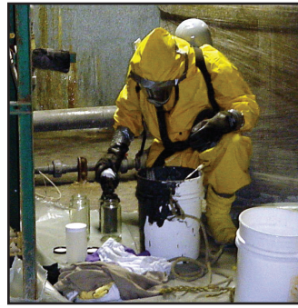
Electronics Manufacturing Company

BBJ Group provided the South Carolina Budget and Control Board with a long-term care site model evaluation of the LLRW disposal facility. Work included a 100-year closure period extended care cost development; comparative analysis for currently operating, closed, or planned LLRW disposal facilities in other states; and alternative financing and implementation scenarios for closure. Findings were presented to South Carolina's Nuclear Advisory Commission.