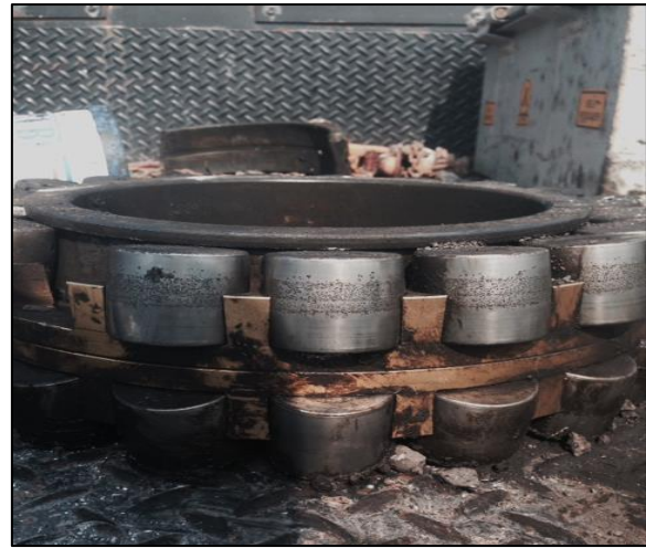
The damage primarily occurred on one side of the bearing