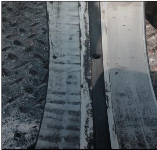
The outer bearing shows impact from spalled bearings

developing pitting and spalling. The damage was concentrated on one side of the bearing, which proved to be a crucial detail when analyzing the root causes of the problem.