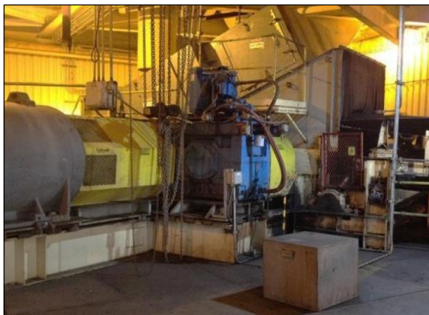
Conveyor in the mine processing plant

The first fault Azima DLI analysts caught during their demo analysis showed elevated harmonics on a drive motor gear pulley in the coal processing plant. The pulley also showed impacting at the head roll coupled-end bearing. The increased speed of the head roll indicated a serious to extreme bearing fault. The initial report presented by Azima DLI analysts after the first day “allowed us to plan the repair at a convenient time for the plant maintenance department,” says the facility’s superintendent. The quick catch allowed mine personnel to repair the fault without any risk of fire or safety. If this fault had been allowed to progress, mine personnel would have had to shut down the conveyor for up to a week. This conveyor is crucial to plant production, and plant production would have suffered a considerable loss.