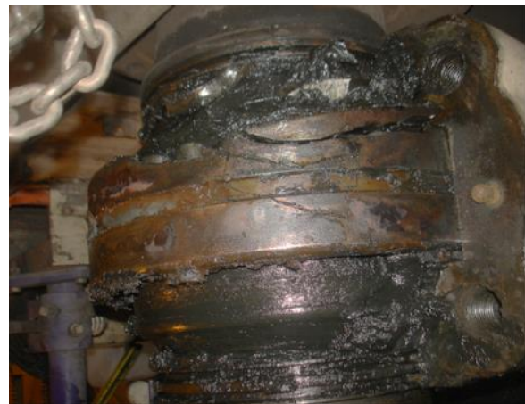
The cracked bearing outer race, prior to repair