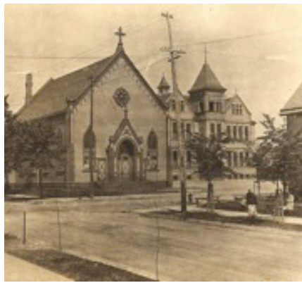
St. Marcus, Milwaukee. 1881 church and 1894 brick school