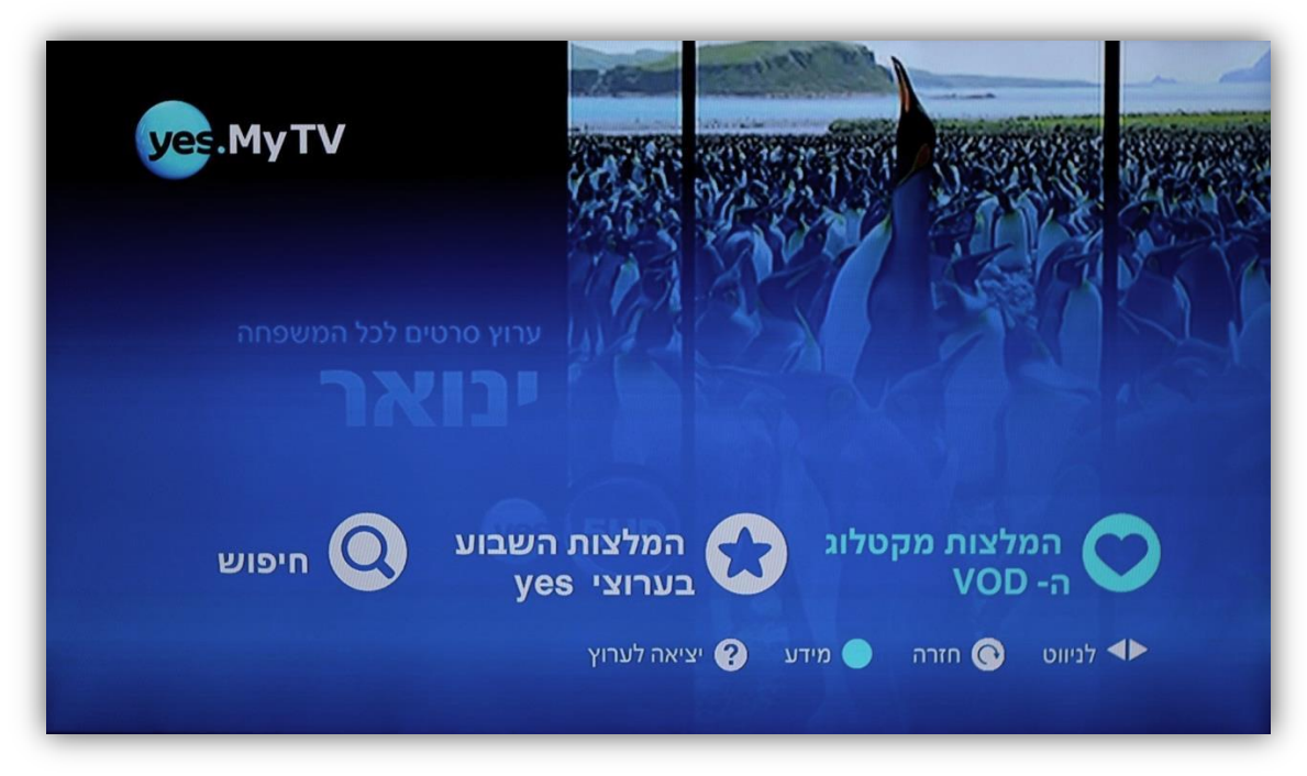
MyTV Portal on Channel 17

58% of the time, users select personal VOD recommendations.