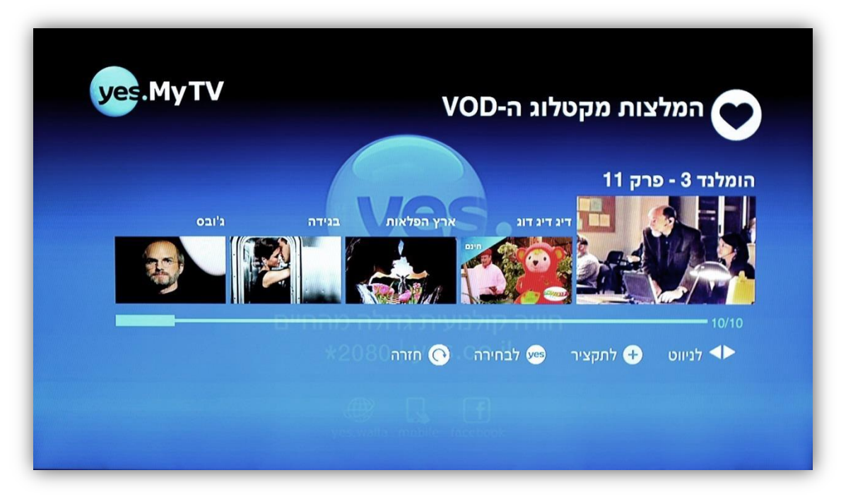
Personal VOD Recommendations Screen

58% of the time, users select personal VOD recommendations.