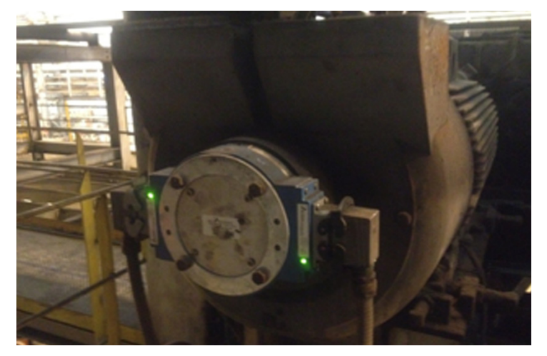
Figure 5-A State-of-the-Art Encoder Installation

When drive technology matured to the point where outer speed regulator loops were digital, the Frequency-to-Voltage Converter Module was no longer needed. These newer drives, and the next-generation fully-digital designs that followed, could accept the frequency directly from the pulse generator without the need for voltage conversion. This also began making the separate digital speed measurement system an unneeded redundancy. The elimination of both, and the associated cost-reduction, was complete by the early 1990s.