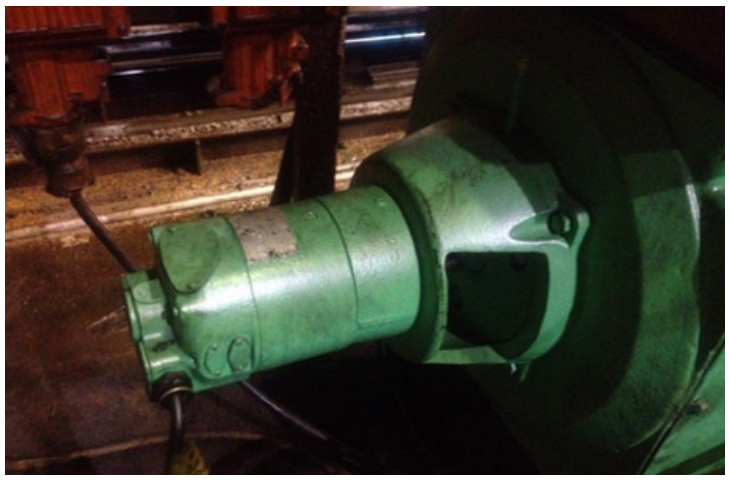
Figure 1-A General Electric BC46 Tach-Generator coupled to a DC motor

Tach-Generators are small DC rotating machines. They are coupled to the motor driving the process and used as voltage generators to measure the speed of the driving device. In legacy metals applications, the driving device would have been a DC motor.