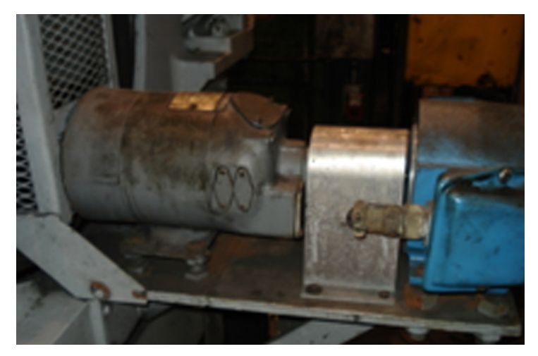
Figure 4A-Tach-Generator/Pulse Generator installation

An added benefit was the combining of the tachgenerator and pulse generator into one device, a dualoutput pulse generator, which simplified the mechanical mounting, thereby improving the reliability of the installation.