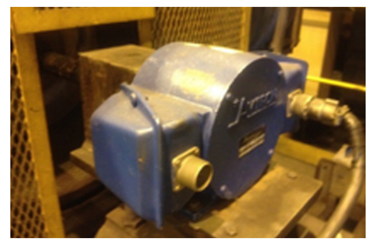
Figure 4B-Dual Output Pulse Generator installation

Both the separate digital speed measurement system and the brushless tach were huge performance improvements and a huge industry success stories. They became the industry standard monitoring and drive feedback solutions in 1973 and lasted until the introduction of hybrid digital-analog drives in the early 1980s.