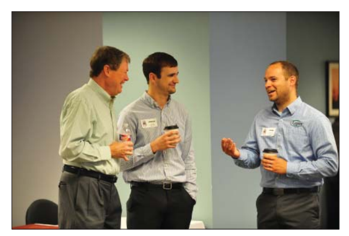
Students at a WCC Direct Ship Marketing Course live event in May in Kansas City, MO.

number of live meetings at different locations around the country, in order to give participants a chance to get together and share ideas in person.