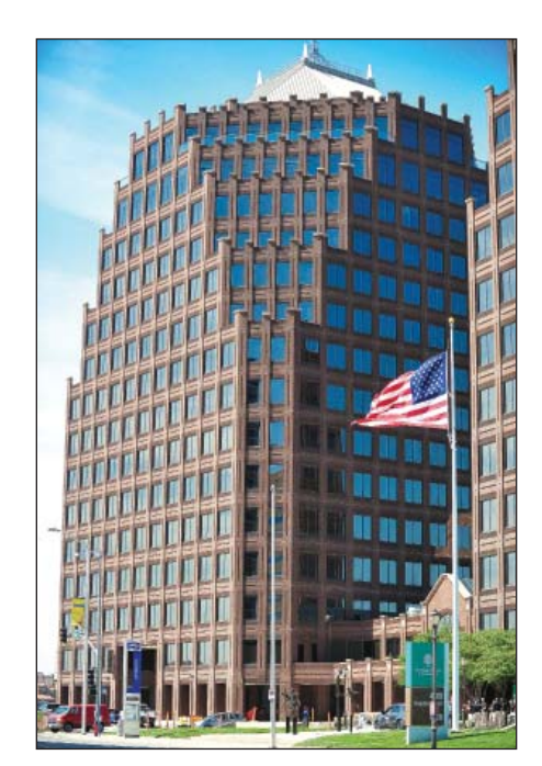
White Commercial Corporation's education training center in the American Century Towers building in Kansas City, MO.

and Canada and has grown its staff to 30 employees.