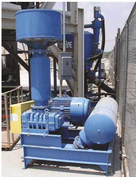
Frame-mounted blower package includes inlet filter with service indicator, premium inlet and exhaust silencers, safety relief valve, and TEFC 3-phase motor.

To unload those fluidized cars, the Cyclonaire sales engineer Ayers contacted put together a