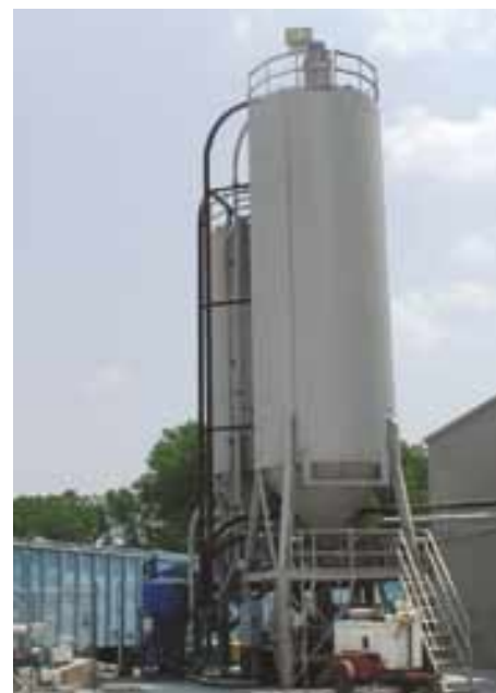
Cyclonaire Conveyor and hopper-bottom railcars team up for fast, clean unloading at R-Con.

to control additives for colored architectural concrete. R-Con is one of only a few plants in the Midwest region with such sophisticated