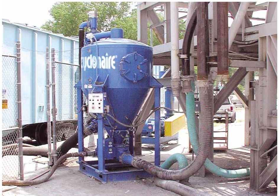
The Cyclonaire Conveyor cycles between vacuum railcar unloading and pressurized conveying to move cement to storage silos or plant. Cyclonaire HC Series Conveyors come in a range of sizes with conveying capacities up to 100 tons per hour and more, depending on model and materials.

package that included a Cyclonaire high-capacity semi-dense phase conveyor with 8" lines in and out. He matched the conveyor with a Cyclonaire 125-hp blower package to supply the air necessary to fluidize and convey cement into 85-foot high silos. Ayers notes, "The system was a perfect fit for me, so I brought Rick Heise and others from R-Con to see the conveyor and what it could do unloading my fluidized cars. I was sure when Rick saw how slick it all worked we could do some additional business."