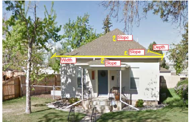
Figure 2: Roof that resulted in inaccurate measurement

types of surrounding vegetation. Aurora's estimated measurements were compared to the measurements taken by NREL staff at each of the physical roof locations.