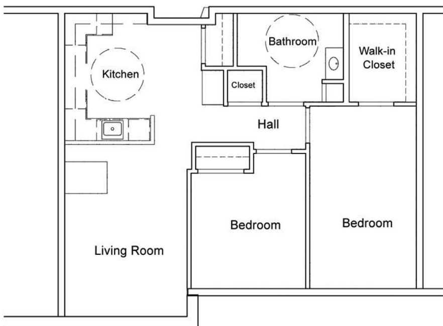
Two Bedroom 883 sq. ft.

We offer one-bedroom and two-bedroom floor plans. These are sample layouts for our apartments. We also have accessible apartments for those with mobility and/or hearing/vision impairments.