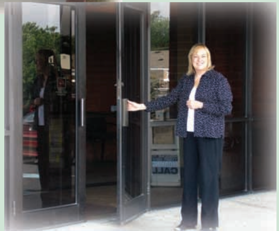
everyday LIFE Center • Bethlehem, PA