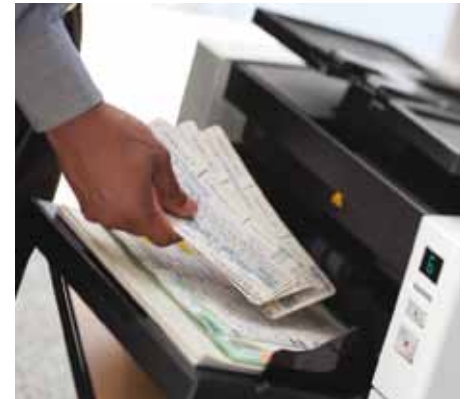
SurePath Paper Handling automatically adjusts for a variety of document sizes and thicknesses.

Smallest scanner in its class to offer a 500-sheet input capacity.