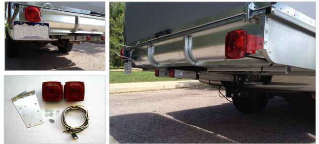
Part No. HCK345