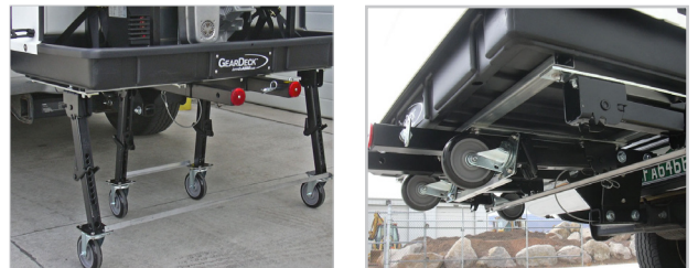
Part No. Standard Length GearCage TT Models - HCK335 Part No. Long Length GearCage TT Models - HCK342