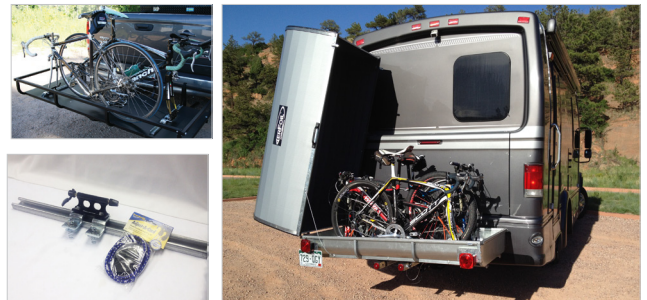
Part No. - One-Bike Mount Kit HCK925 Part No. - Two-Bike Mount Kit HCK932 Part No. Three-Bike Mount Kit HCK949 Part No. Four-Bike Mount Kit HCK956