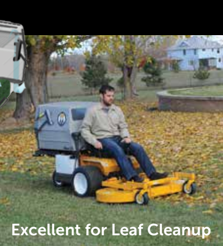
Excellent for Leaf Cleanup

Dual Hydro Axle Combination of hydrostatic transmission and custom gear axle provide a durable and precise drive unit for each wheel