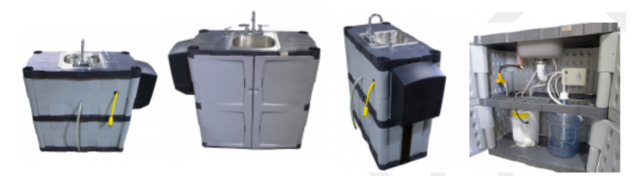
Figure 3: Sani-sink hand wash apparatus. [http://usfirst.biz/wtsproduct/sani-sink/ ]