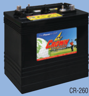
With optional spin vent component