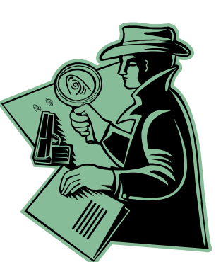
How do you find your customers?

As you identify all your potential clients it's a good idea to enter the information into a data base. You can organize your data base by type of prospect or customer and keep track of your activity with each prospect/customer. For example: the data base will let you pull out a specific type of prospect (i.e. mechanical contractor) so you can send them a newsletter that is designed around their needs and expectations.