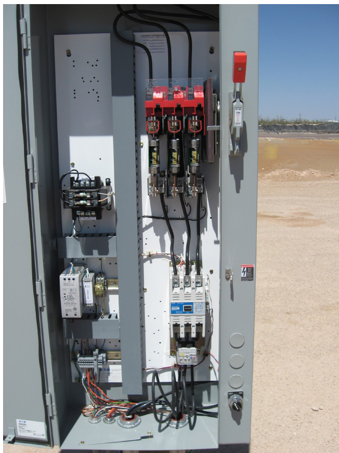
Figure 2. Typical interior pump panel application

pumps, load sensors for proof of pump operation, & much more. Rick chooses the 777 MotorSaver® or 777-KW/HP PumpSaver® when possible as it gives him an advanced motor protection device that provides a UL overload relay and voltage/phase monitor, as well as additional functionality his customers appreciate such as underload and ground fault protection, an on-board display for viewing real-time voltage and current per phase, and optional communications to SCADA via several choices of protocol. If a water or wastewater municipality already has a SCADA system, and is already planning on getting data from a remote pumping station, it's very easy for them to tie in communications from 777s, giving them all the real-time electrical data as well as notification and cause of trips. Knowing not only that a pump motor has tripped, but the cause, can help users determine if a service tech must be sent out immediately or not - saving time, money and frustration.