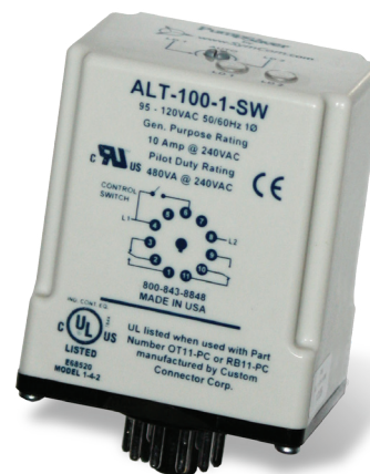
Figure 3. Littelfuse SymCom ALT-100-1-SW alternating relay

"Choosing components that are cost effective because they last [...] saves us money in the long run."