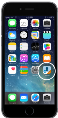
1. Download the app

With the Prospect by LegalShield Mobile App, you can quickly and easily enter prospects into customized campaigns whenever and wherever you meet them!