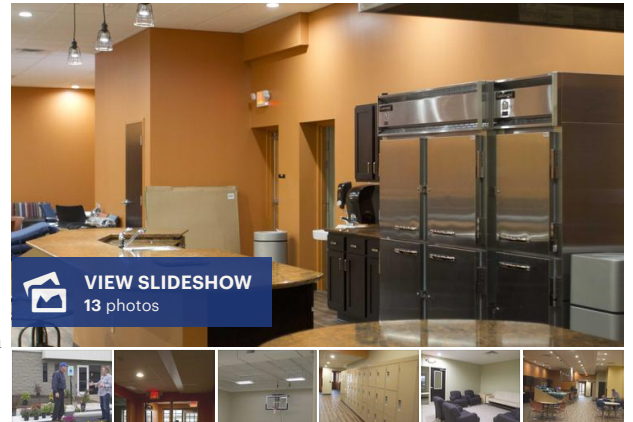
The $2 million renovation of the new Star House facility includes a state-of-the-art... more