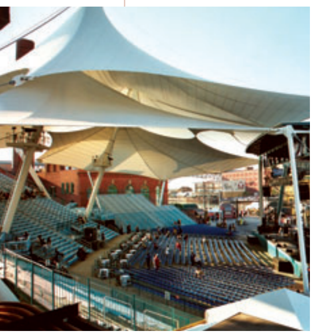
A comfortable structure: "What's more intimate than huddling under an umbrella with a friend?"

Enter Geiger Engineers, which immediately honed in on the complexities of the site, located on the banks of the Cuyahoga River and adjacent to the shores of Lake Erie. "This was an extremely tight site in terms of scope of the