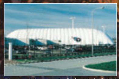
Tennessee Titans practice facility, Nashville, TN