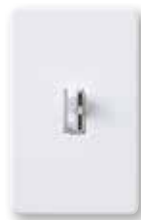
Ariadni® C•L Gloss colors (excluding gray)