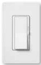
Diva® C•L Gloss and Satin Colors