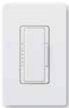
Maestro® C•L Gloss and Satin Colors®

Available in a variety of aesthetic styles and colors to match any décor