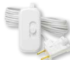
Credenza® C•L Black (BL), White (WH), & Brown (BR)