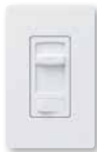
Skylark Contour® C•L Gloss colors