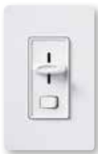
Skylark® C•L Gloss colors