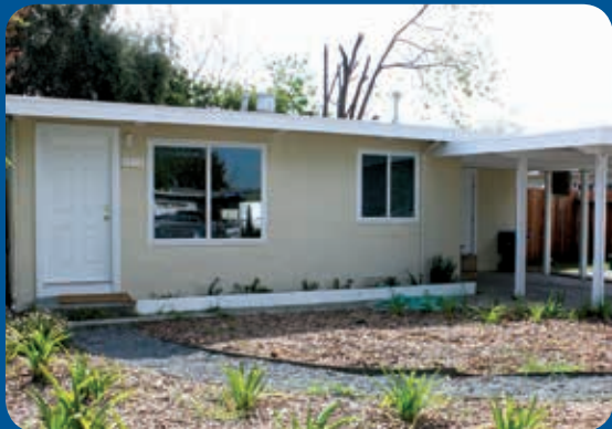
NRP HOME, MADERA AVENUE, MENLO PARK