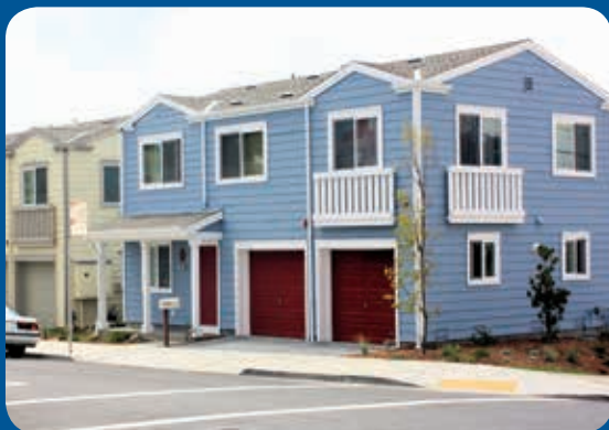
TWO HOMES, PARKVIEW AVENUE, DALY CITY