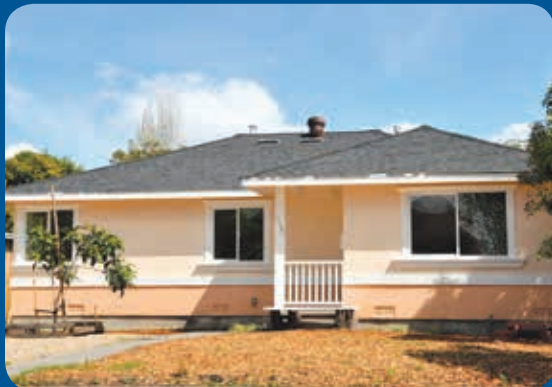
NRP HOME, HOLLYBURNE AVENUE, MENLO PARK