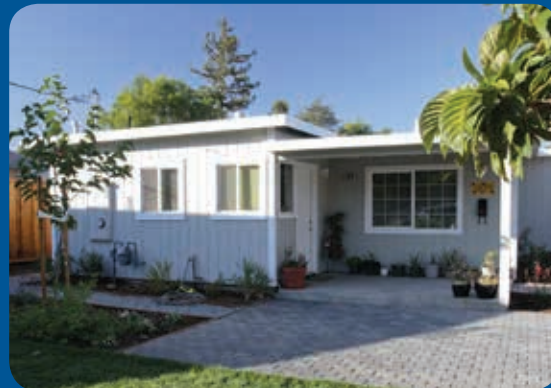
NRP HOME, CENTER ROAD, NOVATO