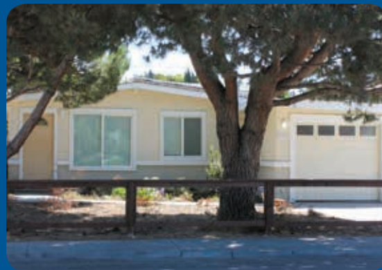
NRP HOME, MARKET PLACE, MENLO PARK