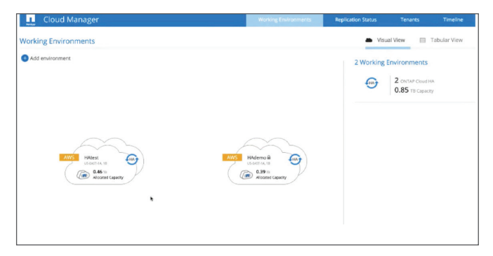
Figure 1) OnCommand Cloud Manager