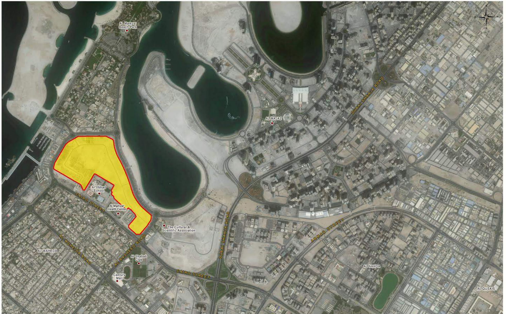
AL MAMZAR FRONT