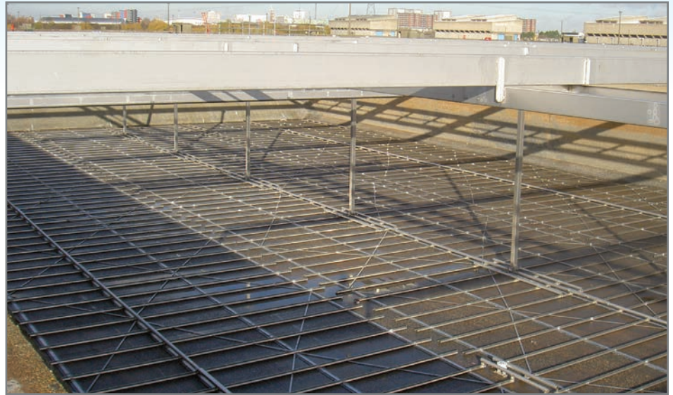
With more than 3000 installations worldwide, the ZICKERT Shark is ideal for wastewater treatment plants and performs well in all sedimentation processes.