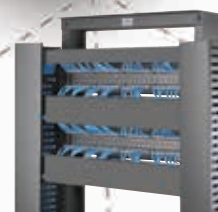
SD Series Cable Manager