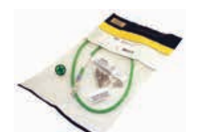
Bonding Jumper Kit