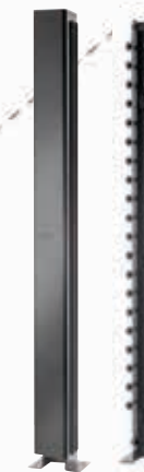
iFRAME Cable Management