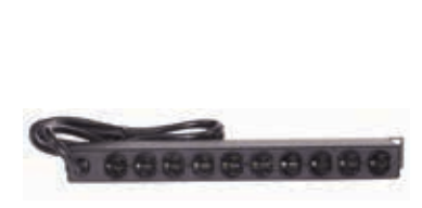
Horizontal Rack Power Strip