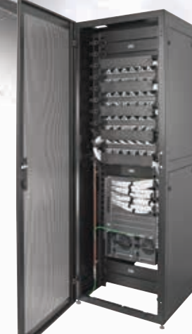
Full Size Enclosure