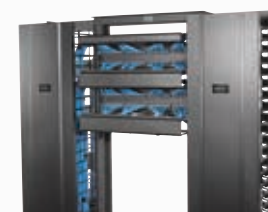
M Series Cable Manager