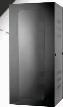
QUADCAB® Wall Mount Cabinet