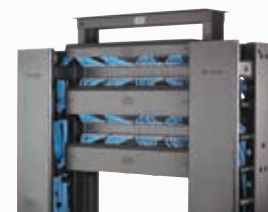
S Series Cable Manager