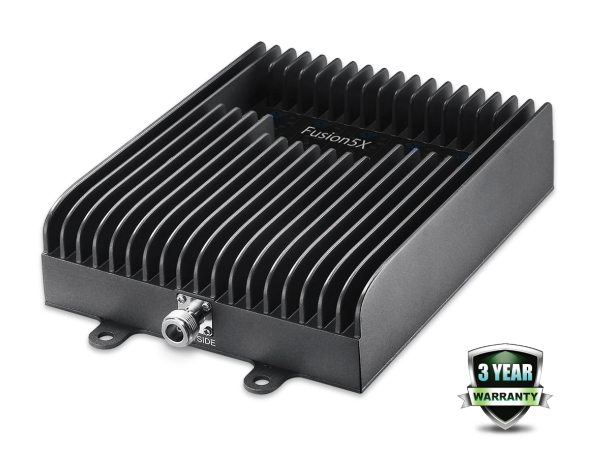
The SureCall Fusion5X signal booster