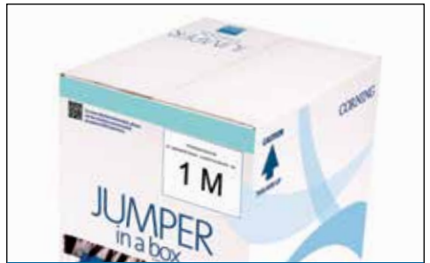
Colored bar indicating single-mode or multimode