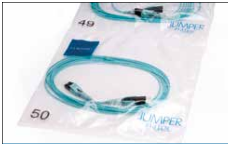
Self-tracking inventory count on each bag