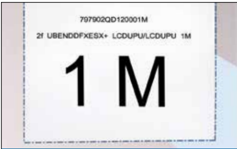
Part number identification at a glance