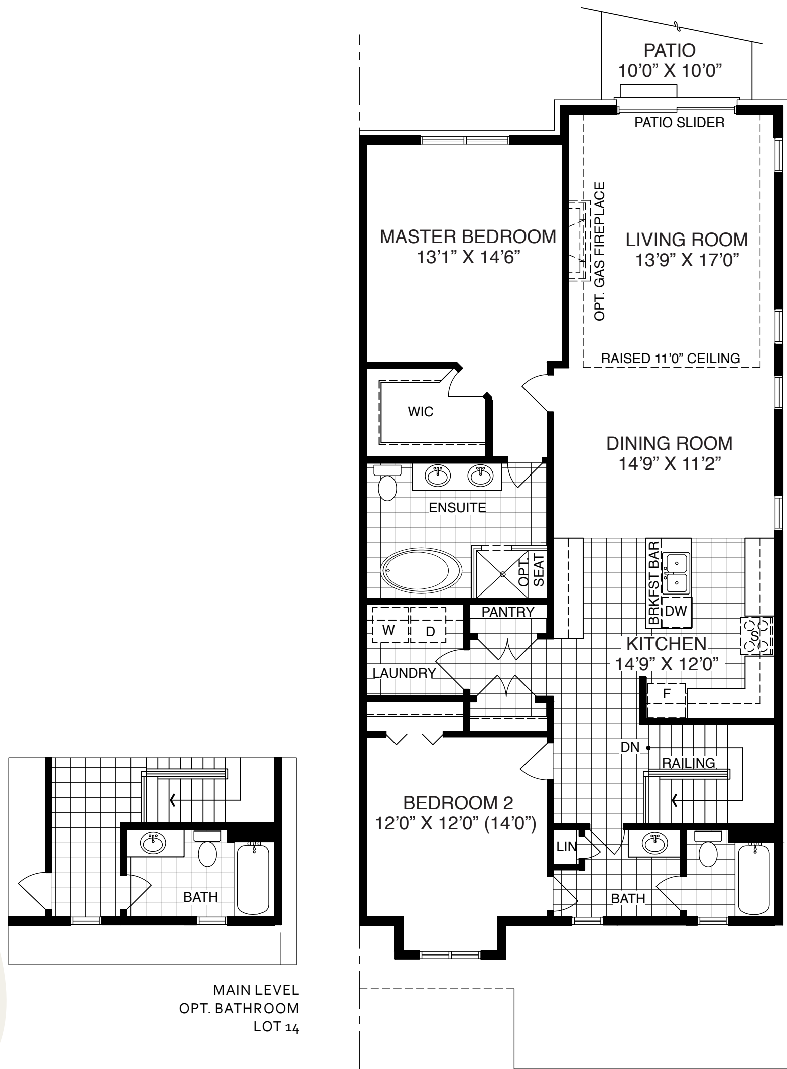
MAIN LEVEL OPT. BATHROOM LOT 14