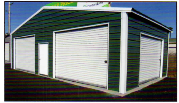
Option: A-Frame Style w/Vertical Metal