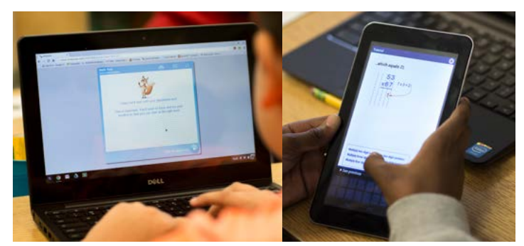
Finding and fixing missing skills