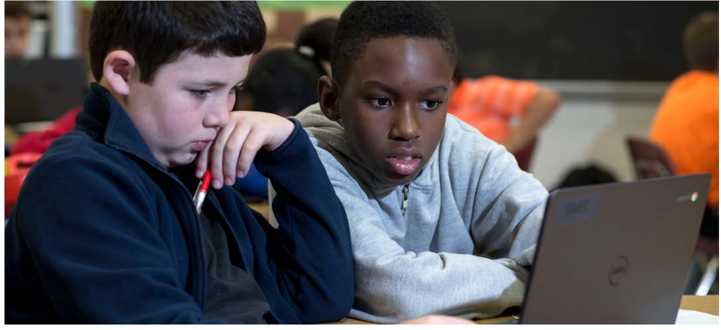
Students learning together with MobyMax

When students can learn something themselves and then go on to teach other students that same content, in my opinion, that's a success.