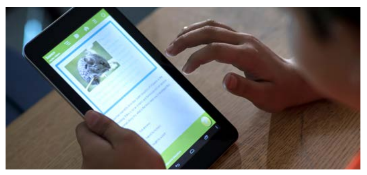
Learning by discovery with Cognitive Skills Science

3. Clicker: The Clicker feature enables teachers to assign questions from an item bank to check for student understanding. "I'll teach for two or three days, then assign 5 to 10 questions in MobyMax through the Clicker feature," he said. "Then I can go in and see that student A has only 33% right, so I'm going to pull her [aside] and make sure she really understands what I'm talking about, whereas student B has 90% right, so I'm going to let him go on to the next rotation and not worry about it."