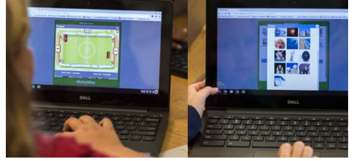
Student using game points and counting badges

Ready to see how MobyMax can impact your students' learning? Register FREE at mobymax.com