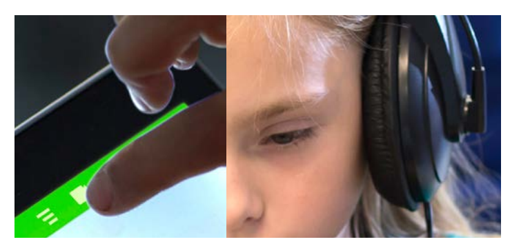
Student rewinding fractions lesson