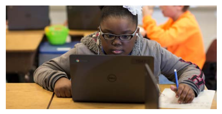
Student performing 3X higher in math

For the lowest students, MobyMax is "pulling them up to grade level," he said. "For me to sit there with a student and get him up to grade level in nine weeks would take all of my time, whereas MobyMax is filling those gaps quickly."