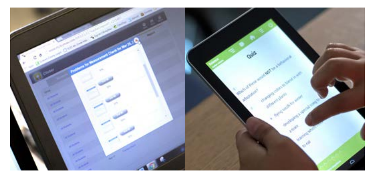
Derek checking student's comprehension