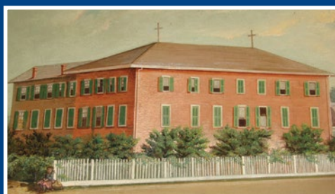
Wilson House occupied by Maryvale from 1856-1891

With a commitment to serving the poorest of the poor, five Daughters of Charity arrived in Los Angeles on January 6, 1856 by boat from their American Provincial House in Maryland to open Los Angeles' first orphanage and hospital