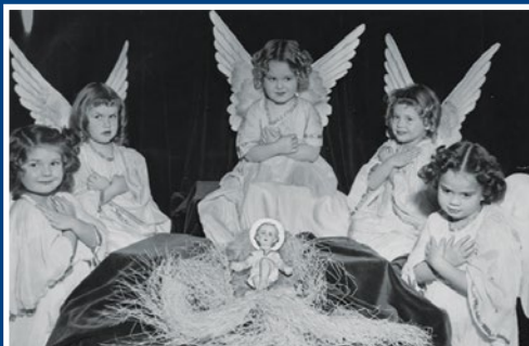
Christmas 1930's at Maryvale

the joy of Christmas by making Jesus the center of our celebrations; creating an atmosphere of love, giving and gratitude.