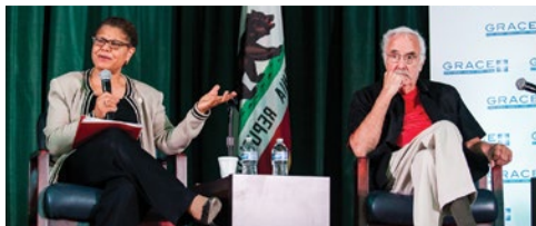
U.S. Congresswoman Karen Bass and Retired Senator John Burton

On July 29th, Maryvale hosted over 200 attendees for the "Improving Outcomes for Foster Youth in California" conference convened by GRACE (a ministry of the Daughters of Charity) and the National Foster Youth Institute. Speakers included U.S. Congress members Karen Bass, Judy Chu, Jim McDermott, and Adam Schiff, as well as, Senator John Burton, California Assemblywoman Holly Mitchell, Former