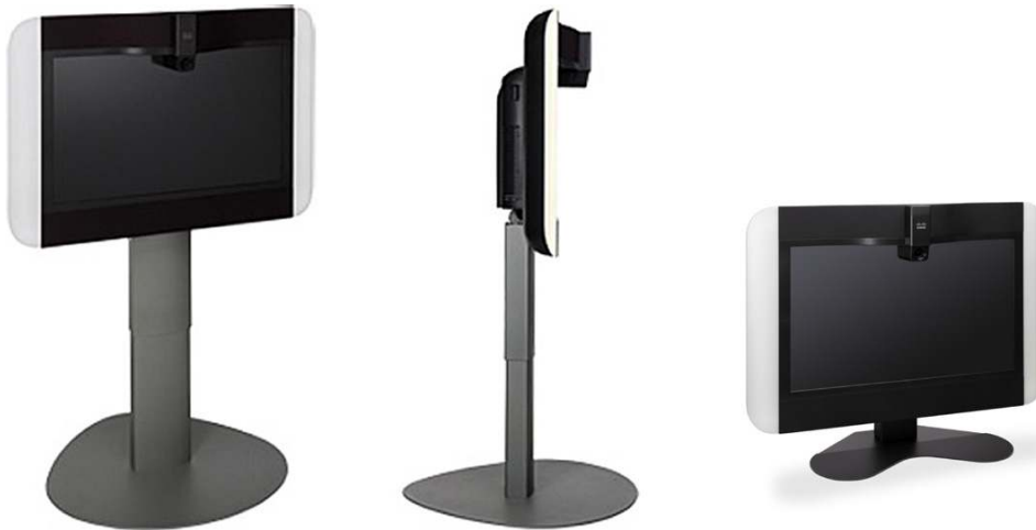
Figure 1. Personal Telepresence for the Office with the Cisco TelePresence System 500 Series