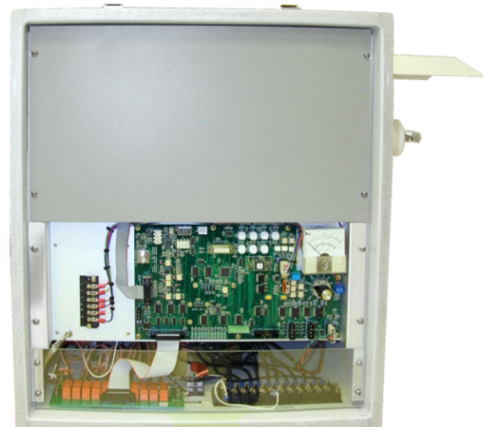
IP-66 Enclosure with Door Removed and Panels in Place