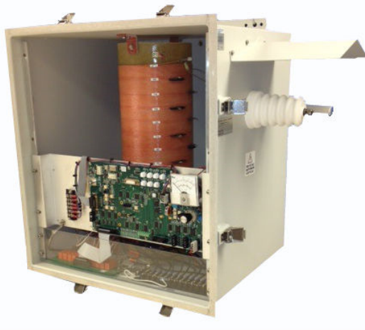
PC-1000C4 Antenna Coupler

5055 Belmont, Beaumont, TX 77707 Phone +409.842.1717/1.800.648.6158 (Toll Free in the US) Fax +409.842.2987 sales@southernavionics.com