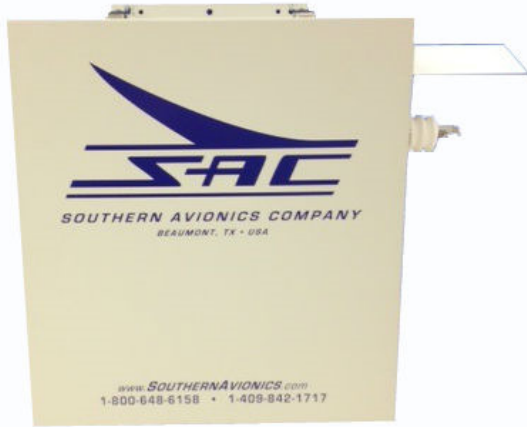
IP-66 Enclosure with removable Door