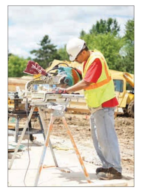
If every volunteer gave $10 a month, we could help dozens more families buy homes each year. Visit tchabitat.org/cc to do your part!

Consider becoming a donor, as well as a volunteer, by joining the Carpenter's