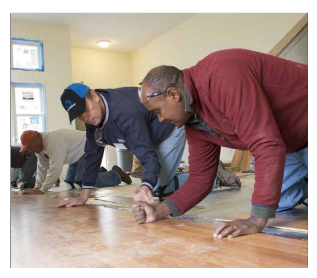
All Habitat homebuyers complete a combination of sweat equity hours, financial training, and homeownership classes. This preparation — combined with affordable mortgages — ensures families are set up for success.

A member of the Twin Cities Habitat Board of Directors is matching a year's worth of gifts from all new Carpenter's Club members — plus gift increases