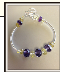
"Heart for Hospice" Bracelet

The Heart for Hospice bracelets may also be purchased at our offices in Randolph, Monday through Friday from 8:00am to 4:30pm or by visiting our website: www.OldColonyHospice.org .