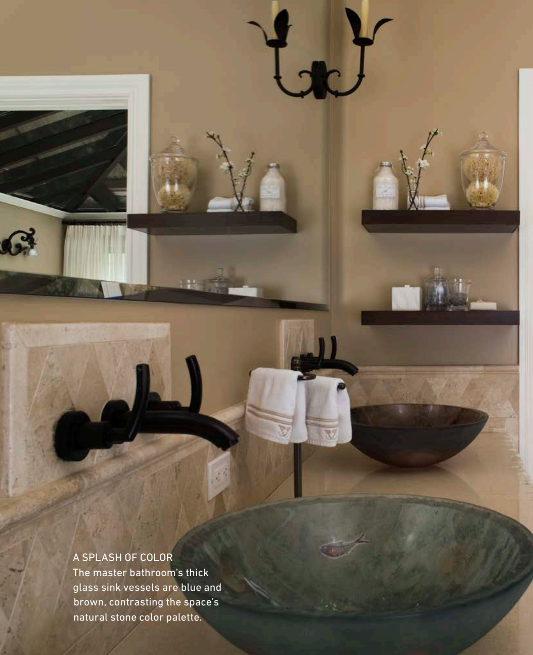
A SPLASH OF COLOR The master bathroom's thick glass sink vessels are blue and brown, contrasting the space's natural stone color palette.