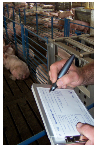
Capture barn activity with any Windows® Mobile CE device (L) or the economical PigPEN™ digital paper system (R).