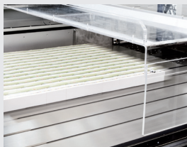
Strip stack infeed