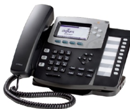
D50 / Mid-level