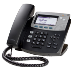
D40 / Entry-level