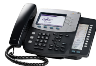
D70 / Executive-level