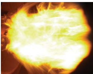
Flame pattern of the BLUEMAX burner from EISENMANN

The advantages of BLUEMAX are due to an improved swirl burner and an innovative burner lance.