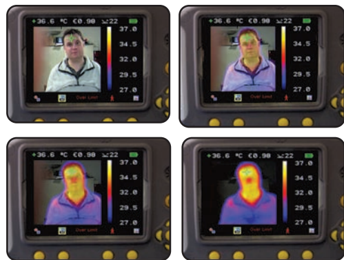
■ How the technology detects different levels of body heat to check for signs of illness