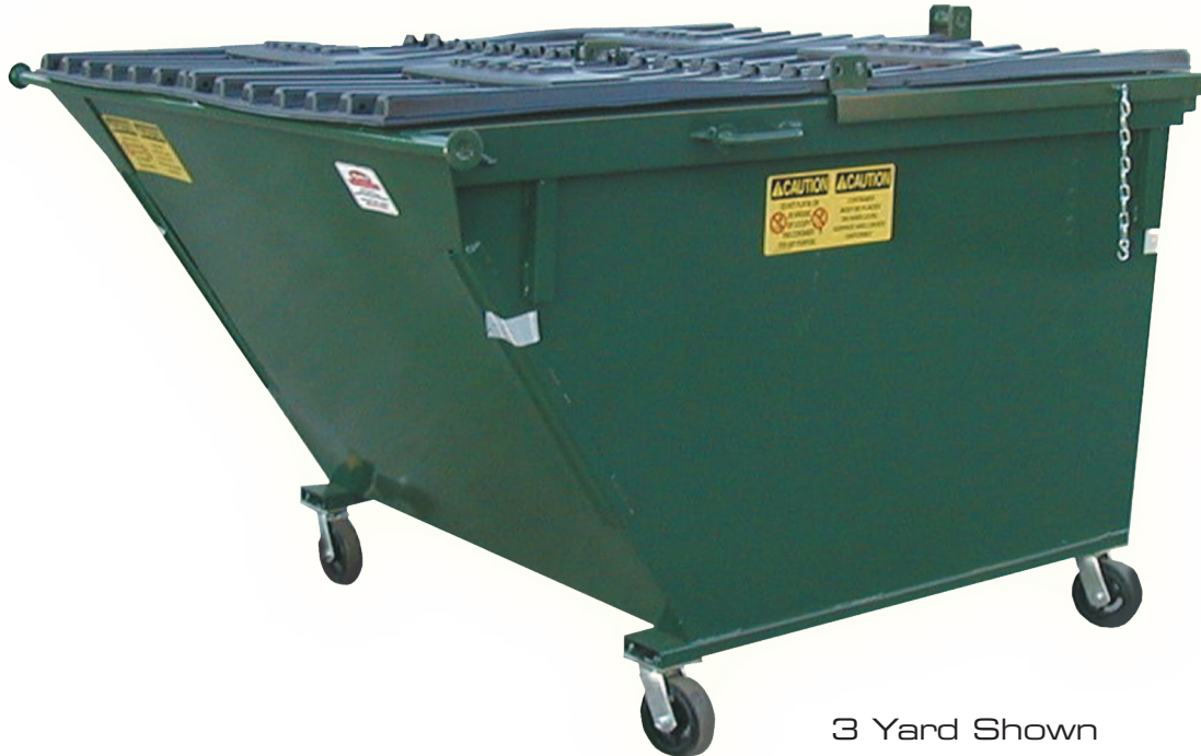
3 Yard Shown